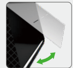
transparent front films