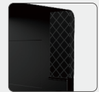
4 transparent back films